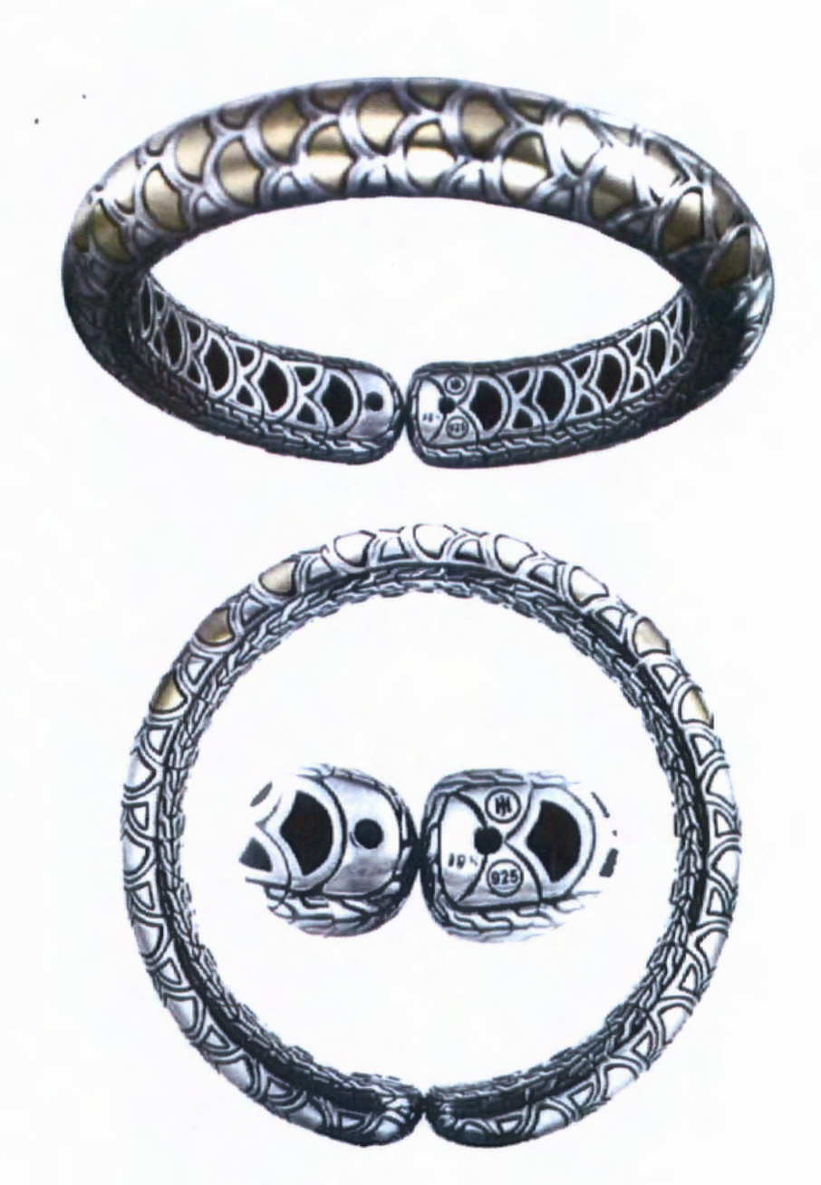
NAGA GOLD & SILVER