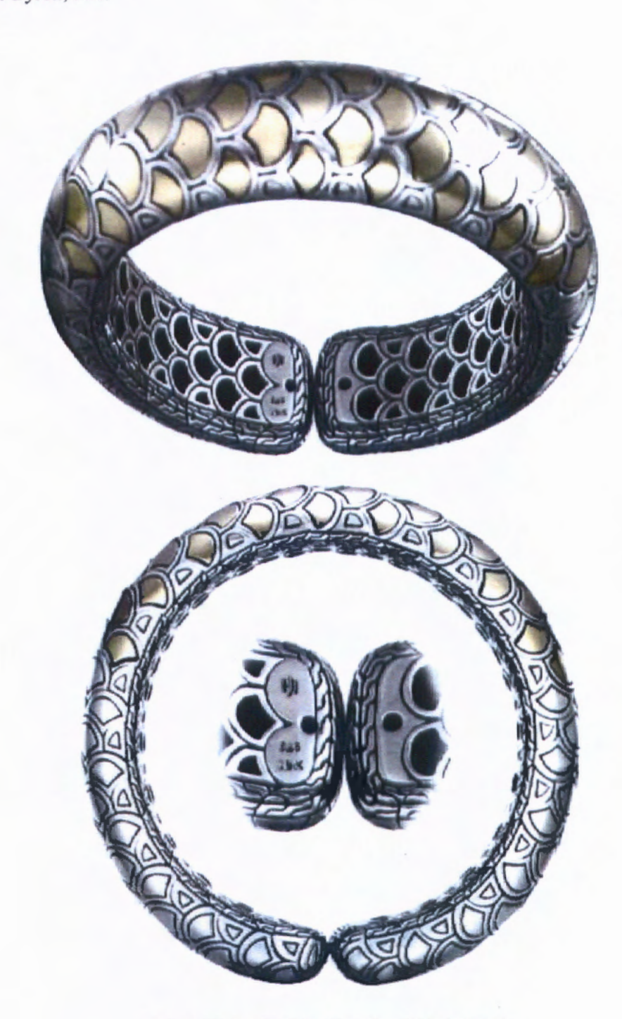
NAGA GOLD & SILVER