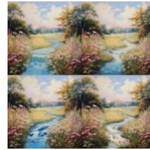
(4) Generate Candidate Images with Prompt: meadow stream lithograph