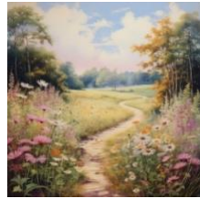
(2) Select and Upscale Image