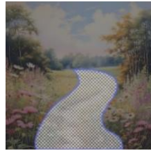
(3) Use Freehand Editing Tool to Select Region