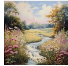
(5) Select and Upscale Image

The image was further modified by repeating the editing process: