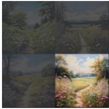
(1) Generate Candidate Images with Prompt: meadow trail lithograph

Many popular AI platforms offer tools that encourage users to select, edit, and adapt AI-generated content in an iterative fashion. Midjourney, for instance, offers what it calls “Vary Region and Remix Prompting,” which allow users to select and regenerate regions of an image with a modified prompt. In the “Getting Started” section of its website, Midjourney provides the following images to demonstrate how these tools work. 136