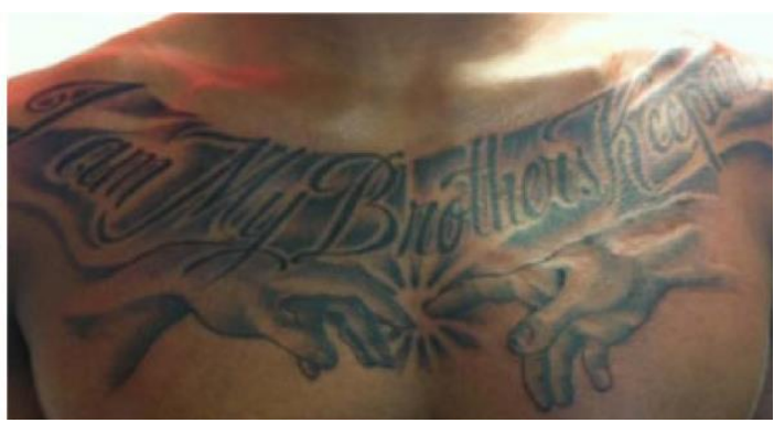
The Creation of Adam