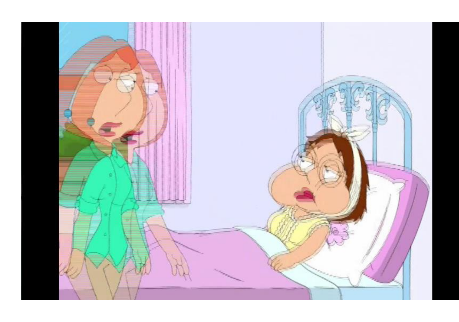
Unacceptable 3-2 pulldown errors showing double image frames