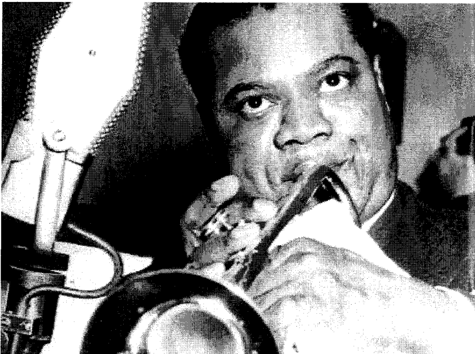
Enlarge Louis Armstrong

announced the largest donation of audio recordings it's ever received. The donation came from Universal Music Group and is made up of master recordings - the final metal discs used to press commercial releases; lacquer Courtesy of Decca discs that were cut in the studio to capture full takes