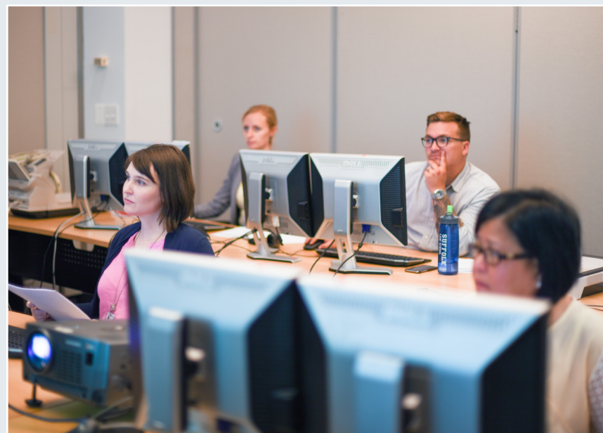
The new copyright examiners hired in fiscal 2016 take part in a yearlong training program. In addition to extensive computer training, they learn about the review process in all registration divisions: Literary, Performing Arts, and Visual Arts.