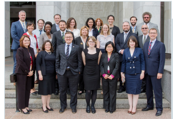
Twenty-three copyright examiners were hired in fiscal 2016.

Through the Copyright Academy, a staff training program, the Copyright Office offered a fifteen-week copyright law class for newly hired examiners in the Registration Program. Another copyright law class was tailored for staff in the Public Information Office, who answer inquiries about copyright law, copyright registration, and the practices and services of the Office. Taught by legal staff in the Registration Program, the class helped to ensure that staff in the Public Information Office and the Registration Program have a common understanding of the Compendium of U.S. Copyright Office Practices .