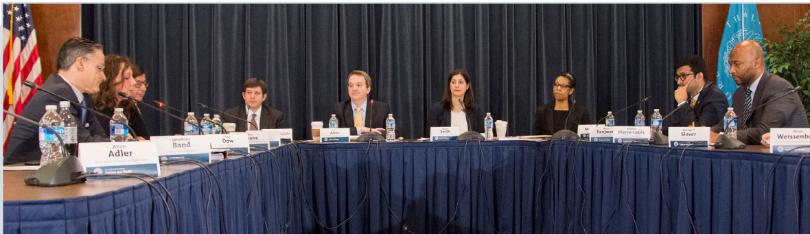
The Office held public roundtable hearings on the Section 1201 study in Washington, DC, and San Francisco in fiscal 2016.

The Copyright Office published The Making Available Right in the United States in February 2016. It analyzes how U.S. law recognizes and protects the “making available” and “communication to the public” rights for copyright holders in the digital age. Two World Intellectual Property Organization (WIPO) treaties to which the United States is a party require member states, including the United States, to recognize the rights of making available and communication to the public in their national laws. Specifically, the treaties oblige member states to give authors of works, producers of sound recordings, and performers whose performances are fixed in sound recordings the exclusive right to authorize the transmission of their works and sound recordings, including through online interactive platforms.