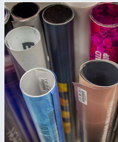
Movie poster deposits that have been scanned and inventoried are awaiting transfer to a storage facility.