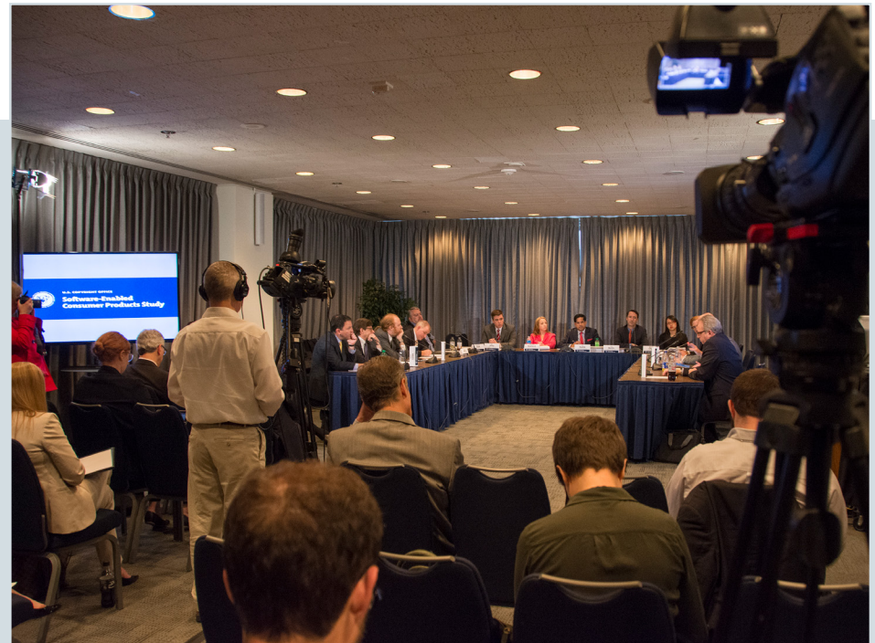
The Copyright Office hosted a public roundtable in May 2016 to discuss with consumer groups and organizations different issues regarding software-enabled consumer products.

changes to clarify the right of consumers to make legitimate use of works containing copyrighted software, including for repair, security research, and resale. The Office held roundtable hearings in Washington, DC, and San Francisco in fiscal 2016 and reviewed thirty-four public comments. The study was scheduled to be published in December 2016.